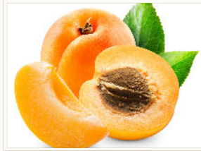
APRICOTS MAY-EARLY JULY